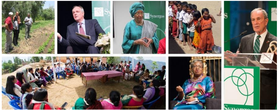
Clockwise from top left: Synergos agricultural project in Ethiopia; Unilever CEO, Paul Polman; President of Liberia, Ellen Johnson Sirleaf at Synergos Headquarters; Synergos child nutrition project in India; Philanthropist, Michael Bloomberg; Synergos Civil Society Network meeting in Nepal; Nigerian Minister of Finance, Ngozi Okonjo-Iweala.

Synergos is widely seen as a credible, 'honest broker' with world-class convening capabilities and the capacity to build trust across sectors.